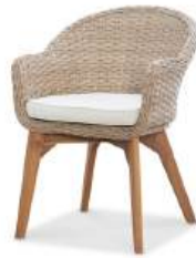
Biscayne Bucket Chair ODC-431 24"W x 27"D x 34"H Aluminum Frame, Weather Resistant Wicker, 100% FSC Teak Legs, Olefin Fabric with Quick Dry Foam