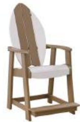
Cape May Counter Stool ODS-526AB 28.75"W x 38"D x 52"H Crafted in Tangent Sustainable Lumber, Made in the USA, Finished in Weathered Wood and White