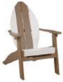
Cape May Folding Adirondack ODC-523B 29.25"W x 36"D x 41"H Crafted in Tangent Sustainable Lumber, Made in the USA, Finished in Weathered Wood and White