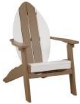
Cape May Folding Adirondack ODC-523B 29.25"W x 36"D x 41"H Crafted in Tangent Sustainable Lumber, Made in the USA, Finished in Weathered Wood and White