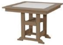
Cape May Tabletop with Cape May Dining Base ODT-450T/ODT-450B-30 38"W x 38"D x 30"H Crafted in Tangent Sustainable Lumber, Made in the USA, Finished in Weathered Wood and White with a Parasole Hole and cap