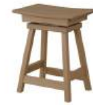
Cape May Saddle Swivel Stool ODS-441SB 20"W x 14.5"D x 23.75"H Crafted in Tangent Sustainable Lumber, Made in the USA, Finished in Weathered Wood