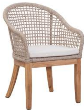
Shenandoah Dining Chair ODC-300 26"W x 25"D x 35"H Aluminum Frame, Woven Abaca Rope, 100% FSC Natural Teak Base, Olefin Fabric with Quick Dry Foam, and a Custom Fit Cover

Just 75 miles from Washington DC, Shenandoah National Park features cascading waterfalls, vast vistas, fields of wildflowers, and quiet wooded hollows. With over 200,000 acres of protected lands that act as home to deer, songbirds, and black bear – Shenandoah Park was considered the American frontier before the rest of the continent was explored.