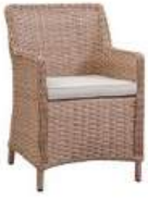
Biscayne Dining Chair ODC-400 24"W x 22"D x 33"H Aluminum Frame, Weather Resistant Wicker, Olefin Fabric with Quick Dry Foam