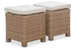
Biscayne Stool Set (Sold as Set Of 2) ODS-442 16"W x 16"D x 19"H Aluminum Frame, Weather Resistant Wicker, Olefin Fabric with Quick Dry Foam