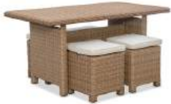
Biscayne 5-Pcs Dining Set (includes table and 4 stools) ODT-455 34"W x 60"L x 30"H Aluminum Frame, Weather Resistant Wicker, Olefin Fabric with Quick Dry Foam