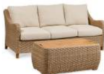
Biscayne 3-Seater Sofa with Coffee Table ODC-463 33"W x 78"L x 33"H 24"W x 43.75"L x 18"H Aluminum Frame, Weather Resistant Wicker, Olefin Fabric with Reticulated Foam, and a Custom Fit Cover