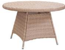
Biscayne Dining Table ODT-448R 48"D x 30"H Aluminum Frame, Weather Resistant Wicker, Parasole Hole (no cap)