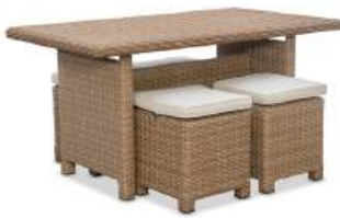
Biscayne 5-Pcs Dining Set (includes table and 4 stools) ODT-455 34"W x 60"L x 30"H Aluminum Frame, Weather Resistant Wicker, Olefin Fabric with Quick Dry Foam