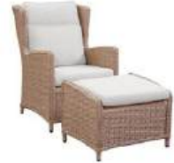
Biscayne Lounge Chair with Footstool ODC-421C 36"W x 26"D x 37"H 21"W x 26"D x 19"H Aluminum Frame, Weather Resistant Wicker, Olefin Fabric with Quick Dry Foam