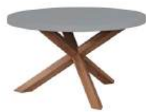
Shenandoah Gray Round Tabletop & Teak Leg Base ODT-351RT-G/ODT-351RB 51"D x 30"H Gray Polystone Top, 100% FSC Teak Legs, and a Custom Fit Cover