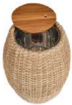
Biscayne End Table (Includes metal ice bucket) ODOT-460RE 18.25" D x 23.5"H Aluminum Frame, Weather Resistant Wicker, Metal Ice Bucket , and a Custom Fit Cover