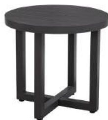
Sequoia Round End Table ODOT-12RE 22"D x 20"H Black Aluminum Frame, and a Custom Fit Cover