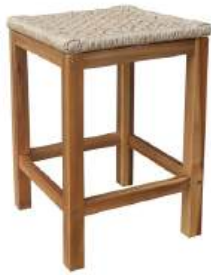
Acacia Backless Stool (Sold as set of 2) ODS-251 15.75"W x 15.75"D x 24"H Acacia Frame (RTA) and a Woven Seat