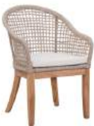
Shenandoah Dining Chair ODC-300 26"W x 25"D x 35"H Aluminum Frame, Woven Abaca Rope, 100% FSC Natural Teak Base, Olefin Fabric with Quick Dry Foam, and a Custom Fit Cover