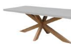
Shenandoah White Rect. Tabletop & Teak Leg Base ODT-38037/ODT-38037B 37.5"W x 80"L x 30"H White Polystone Top, 100% FSC Teak Legs, and a Custom Fit Cover