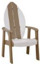
Cape May Arm Chair ODC-525AB 28.25"W x 32.5"D x 46"H Crafted in Tangent Sustainable Lumber, Made in the USA, Finished in Weathered Wood and White