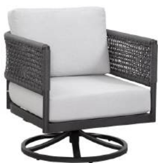
Olympic Swivel Rocker Chair ODC-201SW 31"W x 29"D X 28"H Black Aluminum Frame, Woven Abaca Rope, Olefin Fabric with Quick Dry Foam, and a Custom Fit Cover