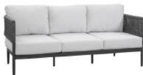
Olympic 3-Seater Sofa ODC-203 31"W x 74"L x 28"H Black Aluminum Frame, Woven Abaca Rope, Olefin Fabric with Quick Dry Foam, and a Custom Fit Cover