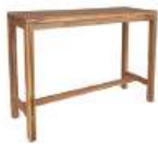
Acacia Counter Table ODT-250 16"W x 48"L x 36"H Acacia Frame (RTA) and an Acacia Plant Style Top