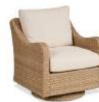
Biscayne Swivel Chair ODC-461SW 30"W x 33"D x 33.5"H Aluminum Frame, Weather Resistant Wicker, Olefin Fabric with Reticulated Foam, and a Custom Fit Cover