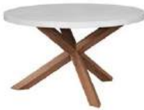
Shenandoah White Round Tabletop & Teak Leg Base ODT-351RT/ODT-351RB 51"D x 30"H White Polystone Top, 100% FSC Teak Legs, and a Custom Fit Cover