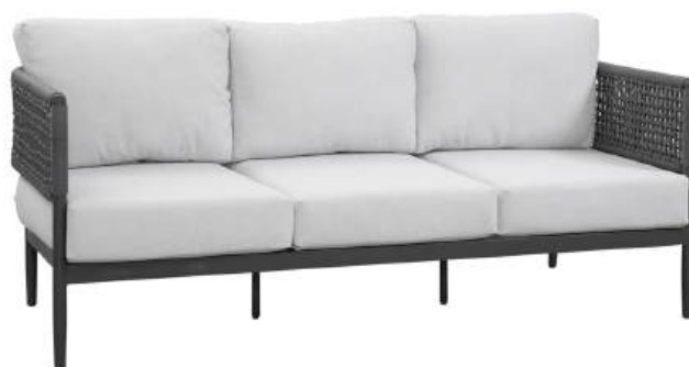
Olympic 3-Seater Sofa ODC-203 31"W x 74"L x 28"H Black Aluminum Frame, Woven Abaca Rope, Olefin Fabric with Quick Dry Foam, and a Custom Fit Cover