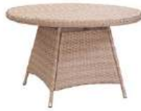
Biscayne Dining Table ODT-448R 48"D x 30"H Aluminum Frame, Weather Resistant Wicker, Parasole Hole (no cap)