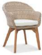
Biscayne Bucket Chair ODC-431 24"W x 27"D x 34"H Aluminum Frame, Weather Resistant Wicker, 100% FSC Teak Legs, Olefin Fabric with Quick Dry Foam