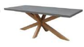
Shenandoah Gray Rect. Tabletop & Teak Leg Base ODT-38037-G/ODT-38037B 37.5"W x 80"L x 30"H Gray Polystone Top, 100% FSC Teak Legs, and a Custom Fit Cover