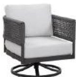
Olympic Swivel Rocker Chair ODC-201SW 31"W x 29"D x 28"H Black Aluminum Frame, Woven Abaca Rope, Olefin Fabric with Quick Dry Foam, and a Custom Fit Cover