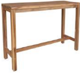
Acacia Counter Table ODT-250 16"W x 48"L x 36"H Acacia Frame (RTA) and an Acacia Plant Style Top