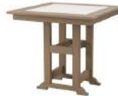
Cape May Tabletop with Cape May Counter Base ODT-450T/ODT-451B-36 38"W x 38"D x 36"H Crafted in Tangent Sustainable Lumber, Made in the USA, Finished in Weathered Wood and White with a Parasole Hole and cap