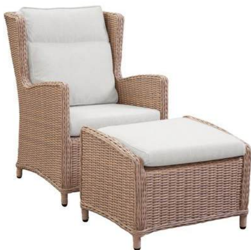
Biscayne Lounge Chair with Footstool ODC-421C 36"W x 26"D X 37"H 21"W x 26"D x 19"H Aluminum Frame, Weather Resistant Wicker, Olefin Fabric with Quick Dry Foam