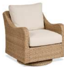
Biscayne Swivel Chair ODC-461SW 30"W x 33"D x 33.5"H Aluminum Frame, Weather Resistant Wicker, Olefin Fabric with Reticulated Foam, and a Custom Fit Cover