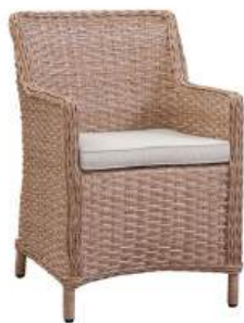
Biscayne Dining Chair ODC-400 24"W x 22"D x 33"H Aluminum Frame, Weather Resistant Wicker, Olefin Fabric with Quick Dry Foam