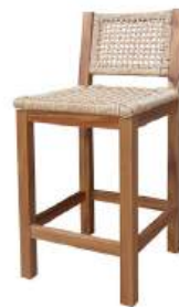
Acacia Counter Stool (Sold as set of 2) ODS-252 15.9"W x 19"D x 36"H Acacia Frame (RTA) and a Woven Back and Seat