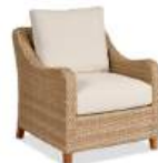
Biscayne Side Chair ODC-461 30"W x 33"D x 33.5"H Aluminum Frame, Weather Resistant Wicker, Olefin Fabric with Reticulated Foam, and a Custom Fit Cover