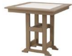
Cape May Tabletop with Cape May Counter Base ODT-450T/ODT-451B-36 38"W x 38"D x 36"H Crafted in Tangent Sustainable Lumber, Made in the USA, Finished in Weathered Wood and White with a Parasole Hole and cap