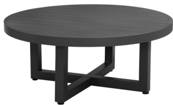
Sequoia Round Coffee Table ODOT-12RC 38"D x 16"H Black Aluminum Frame, and a Custom Fit Cover