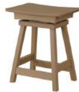
Cape May Saddle Swivel Stool ODS-441SB 20"W x 14.5"D x 23.75"H Crafted in Tangent Sustainable Lumber, Made in the USA, Finished in Weathered Wood