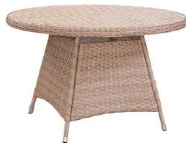
Biscayne Dining Table ODT-448R 48"D x 30"H Aluminum Frame, Weather Resistant Wicker, Parasole Hole (no cap)